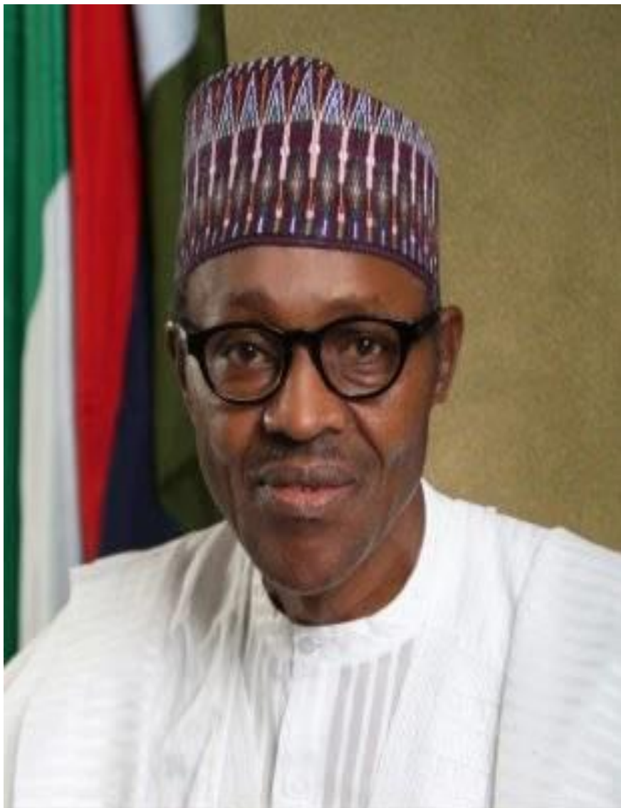
Muhammadu Buhari, GCFR President, Federal Republic of Nigeria