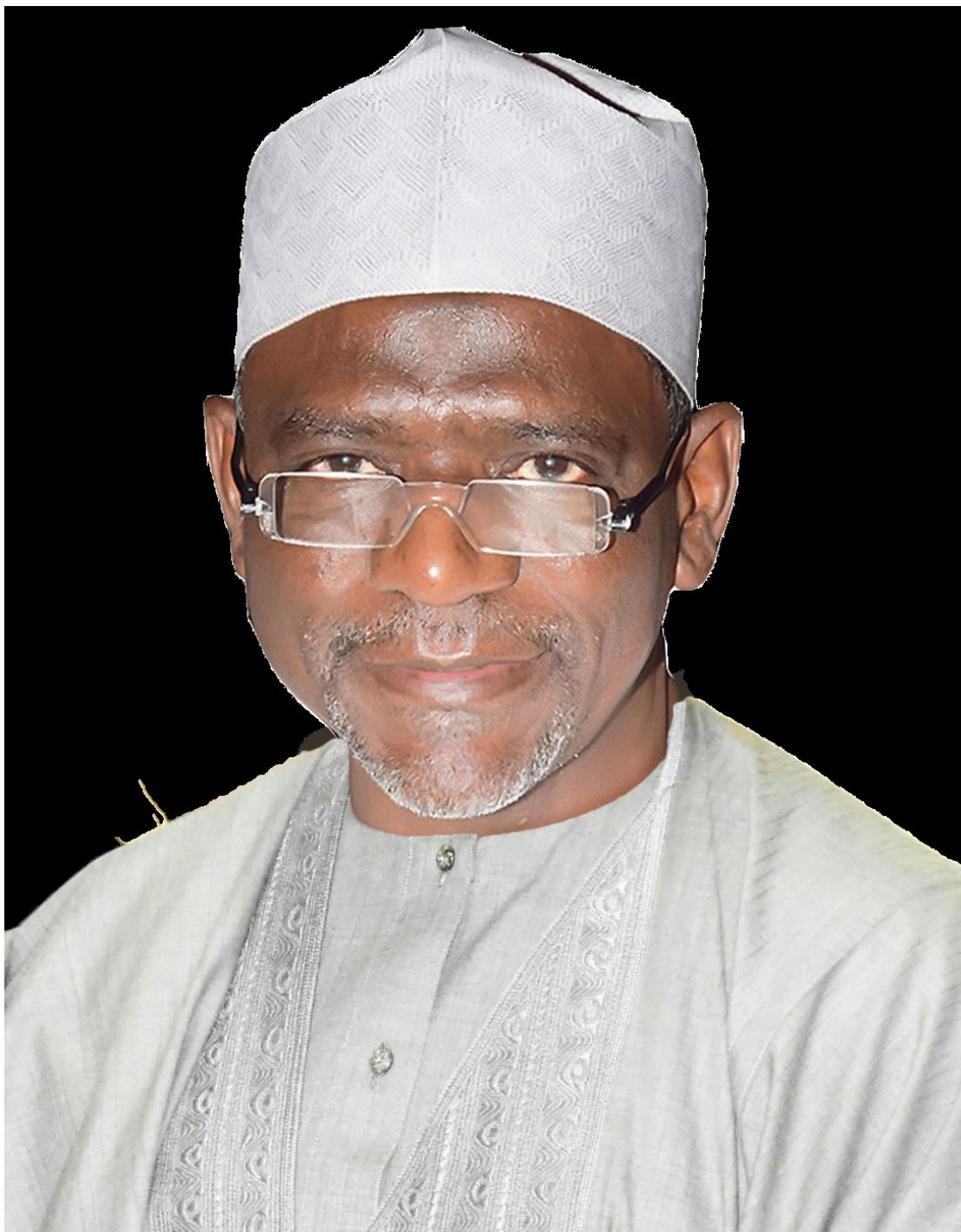
Mallam Adamu Adamu Honourable Minister for Education